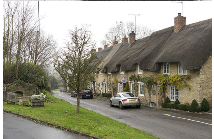
High Street cottages in 1904 and 2017

The village had a church by 1074. The current parish church of Saint Mary may have been rebuilt in the latter part of the 15th century, but only the Perpendicular Gothic tower survives from that time. Major repairs to the roof and south aisle were made in 1668 and 1769, but by the 1860s the nave and chancel were in a poor condition again. The architect, Thomas Talbot Bury, demolished all except the tower in 1865 and rebuilt them in a Gothic Revival interpretation of Perpendicular Gothic. This Victorian building has extremely regular coursed masonry, which departs conspicuously from the traditional Medieval rubble masonry of the tower. Bury preserved only a handful of features from the Medieval church: a Perpendicular Gothic window in the north wall of the chancel, a piscina, a tomb recess and a 13th-century effigy of a priest.