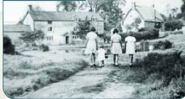
The Old Bake House, 1940s