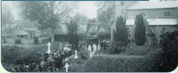
Friendly Society Procession leaving Church c 1900/10

In the 17th century, there were some 30 houses and a population of about 130. The Enclosure Award of 1762 left the village tightly controlled, although, unlike many other villages in the area, Fringford had no manor house after the 16th century. In the 18th and 19th centuries the village was dominated by the Trotman and Harrison families, the squires of Shelswell Manor. In 1844, it was reported that 'Nearly if not the whole of Fringford is the property of JHS Harrison Esq.' Shelswell Manor was abandoned in the 1960s and finally pulled down in the 1980s.