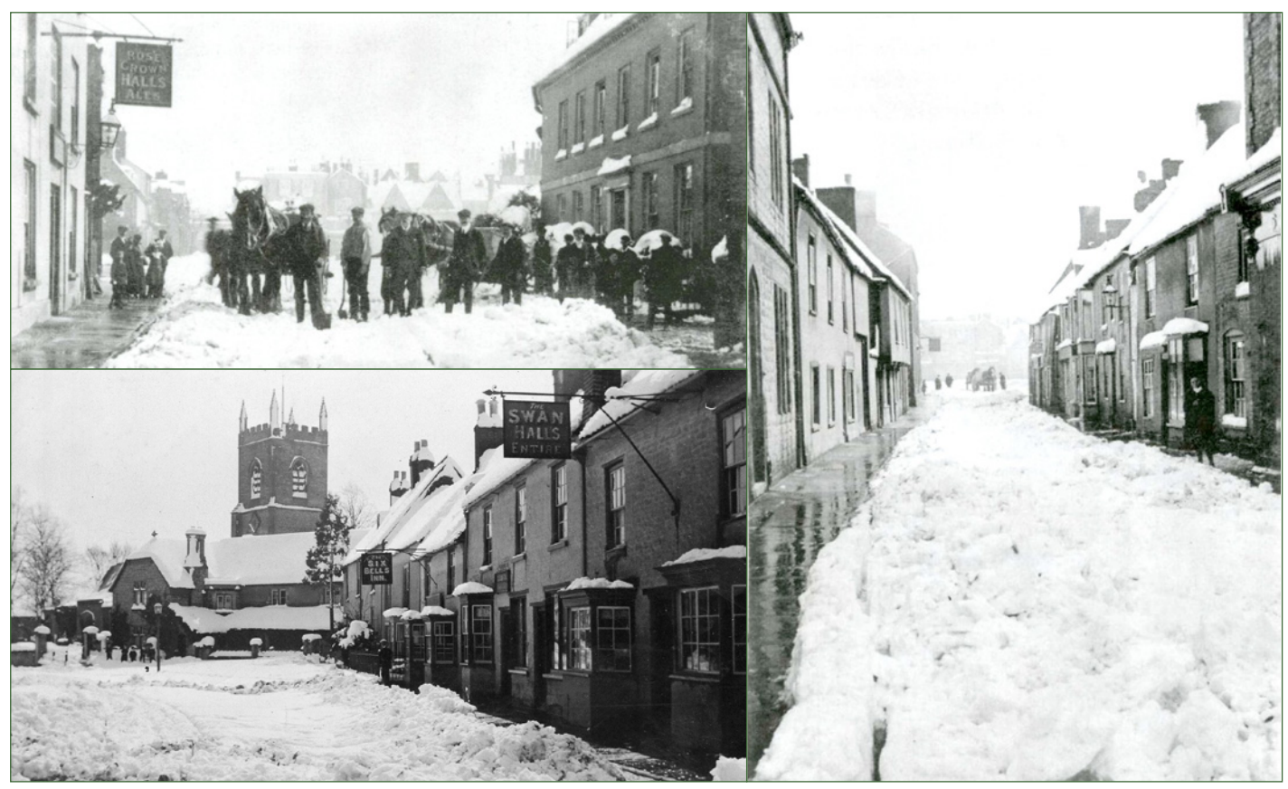
Causeway and Church Street in the snow - 1908