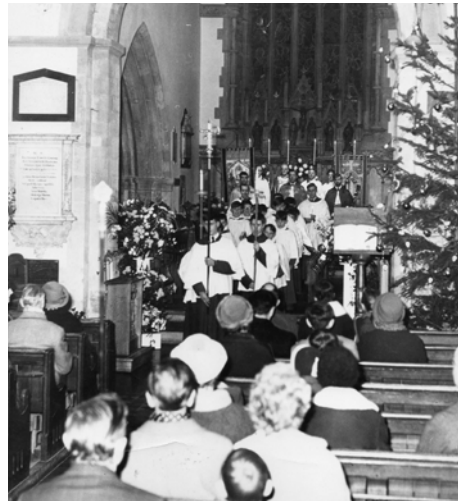
St Edburg's Christmas Service - 1960s