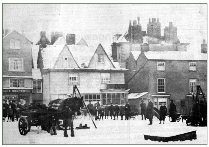
Coal distribution to the poor in Market Square - 1912

As the winter weather sets in it is worth taking a look back at how winter has hit Bicester in the past.