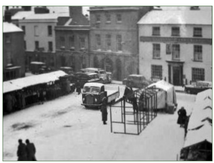
Snow covered market day in Market Square - 1960s