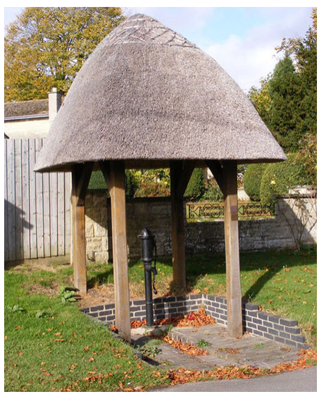
The village water pump, with its thatched roof

Fringford in the 19th century is associated with Flora Thompson's Lark Rise to Candleford trilogy, in which Fringford is the model for Candleford Green. In 1844 the Oxford Chronicle noted "there aren't enough dwellings to shelter the poor". The 1851 census shows a population of 357 and during this time the parish had only a