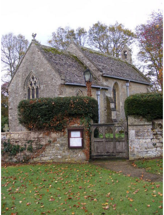
St Mary the Virgin Church

The Fermors were recusants and supported the continuation of Roman Catholicism in the area from the English Reformation in the 16th century until after the Roman Catholic Relief Act of 1791. Late in the 16th century there were few