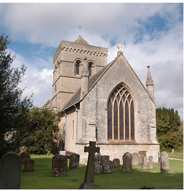
St Mary the Virgin parish church