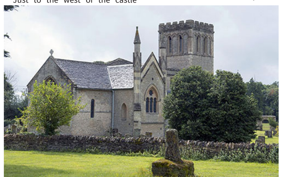
All Saints Church