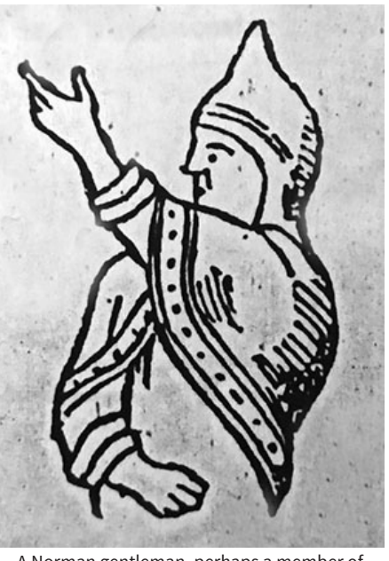
to fashion it into A Norman gentleman, perhaps a member of the Urban Council (or rather the Court Baron).

Now there are tradespeople miller, a blacksmith, baker and butcher. followed brewers by beer and alewives, as the brook is convenient for the supply of water. A cloth manufacturer, called now draper, supplied a rough material for clothing, and a tailor was at hand clothes. A rough