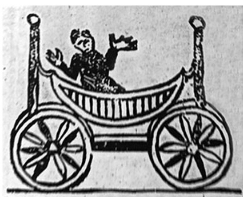
A Saxon bed. One could sleep, by transit, either in King's or Market End.

Now, the village enters upon the fourth stage of its career. In the interim a Saxon Church has been built, to be replaced by one of Norman design. A track from "The Street" leads round by the present Tinker's Lane, now blocked at one end, to the church and the Priory buildings,