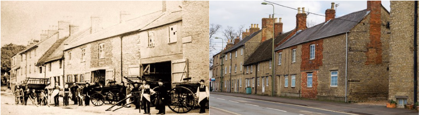
Oxford Road - 1910 & 2021

But rather than try and describe them all here, it seems best to show you a few of the photographs so that you can see some of the changes for yourselves. Anyone who is interested in seeing the full talk can still find it in the 'Members Area' of our website.