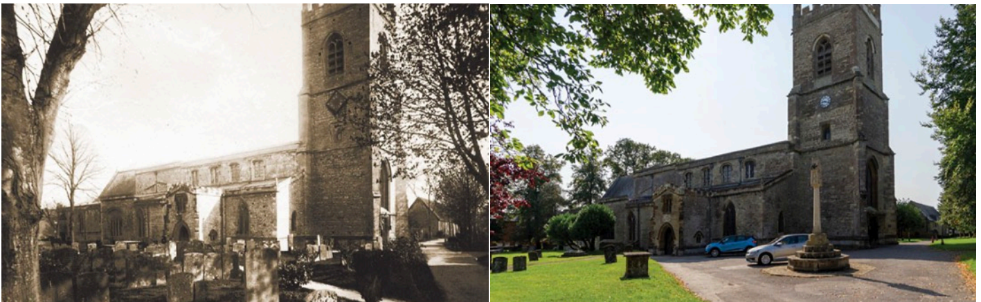
St Edburg's Church - 1890 & 2020

The obvious difference here is the right end of the row of cottages, where the end building has been completely removed and the other workshop bricked up. But we can also see that the building to the left of that has had its door and window swapped around, and the two cottages to the left of that used to be thatched.